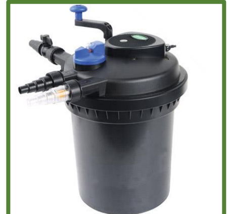
PondXpert SpinClean 4500 - 40000

For maximum flow performance (reduced friction loss) it is recommended that the lowest unused section of all pump and filter hoses be removed if possible. It is also good practice to tip box filters forward slightly, by raising the inlet side. This can improve filtration.