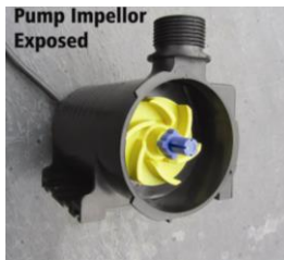
Fig 4, 3500/4500 Impellor