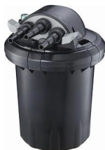
PXPF04500 – PXPF12000