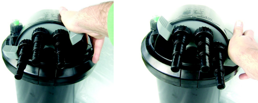
The movement of the cleaning handle from 'work' to 'clean' on PXPFF04500 to PXPFF12000

Turn to the 'clean' position, the water flow is reversed and exits through the waste outlet. This waste water should run to waste by attachment of a suitable length of hose.